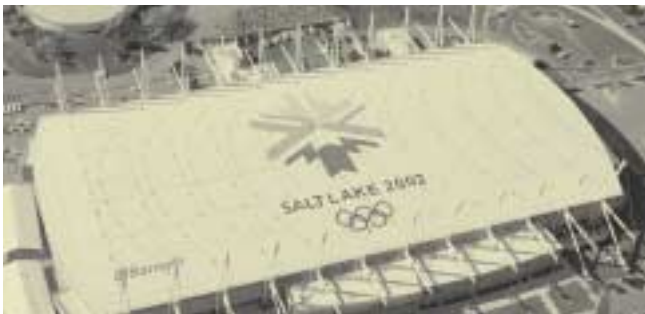
Reflective vinyl roofing membrane