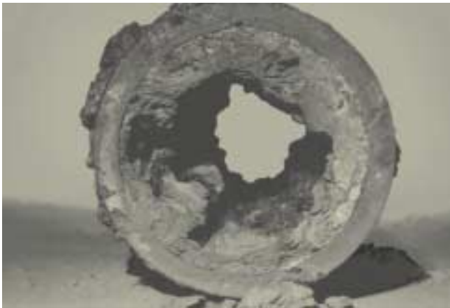
Corrosion in iron pipe